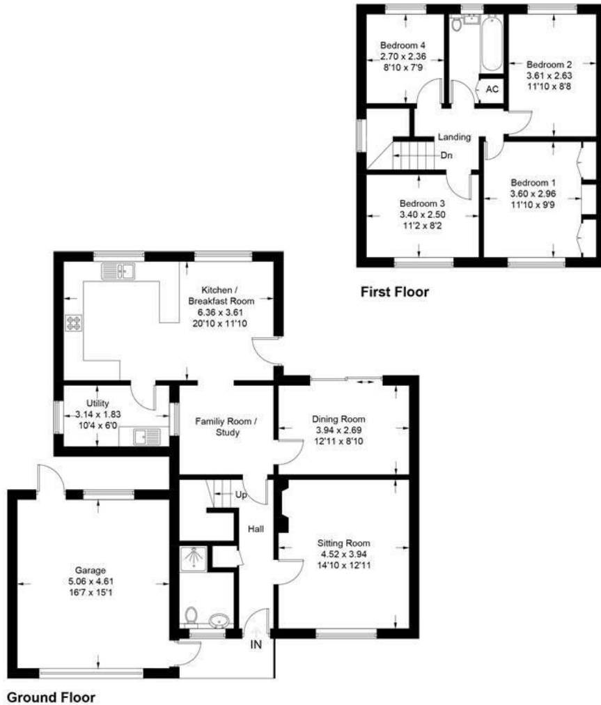
Illustration for identification purposes only, measurements are approximate, not to scale. floorplansUsketch.com © (ID931268)

Approximate Gross Internal Area = 133.0 sq m / 1431 sq ft Garage = 23.7 sq m / 255 sq ft Total = 156.7 sq m / 1686 sq ft